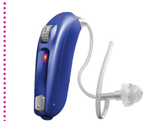
A conference microphone attached to an FM transmitter

They are worn just like a conventional hearing aid. The device receives the radio signals from the radio aid transmitter and converts them into sound. It's easy to check that this device is working correctly because it produces an audio output, but like all other devices, it should be set up for your child by an audiology professional.