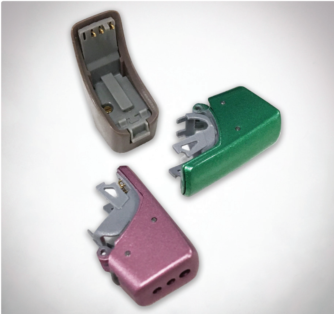
Direct input shoes

Many receivers can be used with a direct input shoe. This can be attached to the bottom of the hearing aid and an ear-level receiver can be plugged into it. Pin connectors on the radio aid receiver fit into three small holes on the bottom surface of the shoe. This can be an ear-level receiver or a direct input lead connected to a body-worn receiver. The electrical signal from a radio aid is then fed wirelessly into the hearing aid, giving a consistent and high quality sound.