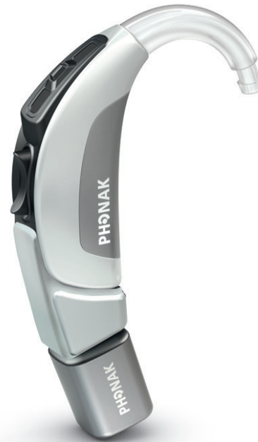
A hearing aid with an ear-level receiver connected by a direct input shoe.