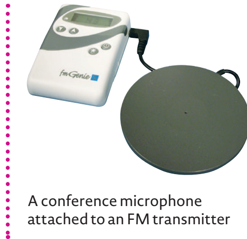
A conference microphone attached to an FM transmitter

Hand-held microphones: these may be used in a classroom and linked to radio aids and soundfield systems (see page 27). These are useful for group work and discussions as they can be passed around.