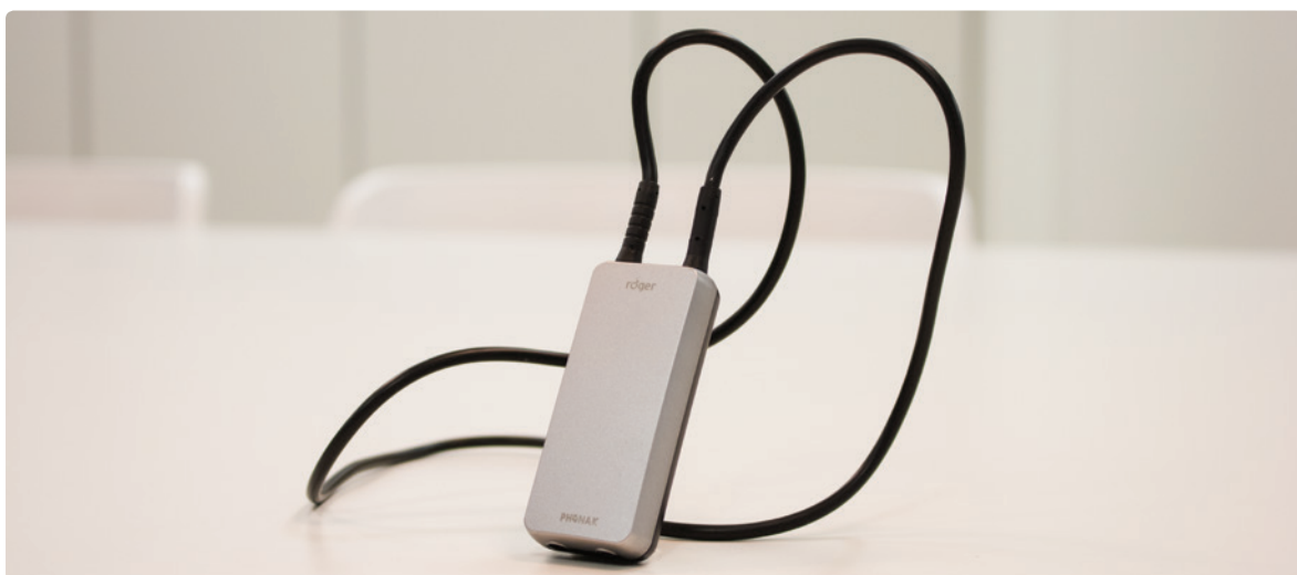
A neckloop receiver

Neckloop receivers are easy to set up and use. They are popular with children who like to wear the neckloop under their clothing and with children whose hearing aids don't have the direct audio input option, for example in-the-ear hearing aids.