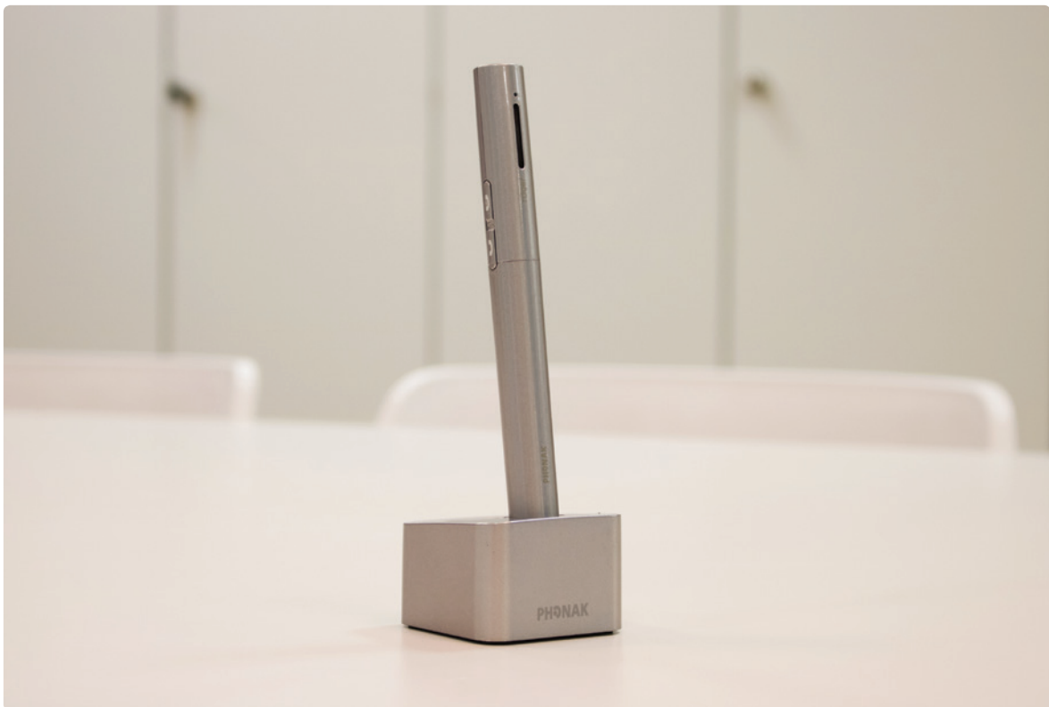
A Phonak Roger Touchscreen Mic transmitter

A radio aid system is made up of a transmitter and a receiver. There are two different types of radio aid transmitters and receivers: digital and FM. The two systems are not compatible with each other.