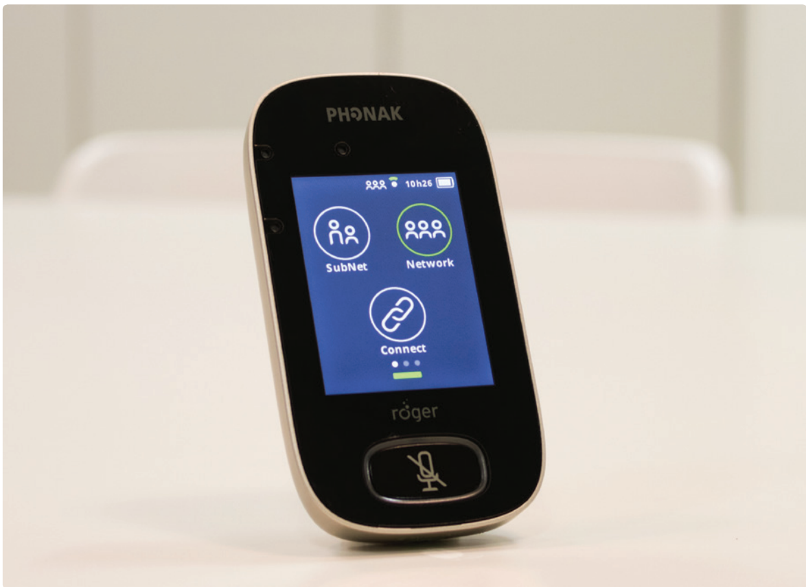
A Phonak Roger Touchscreen Mic transmitter