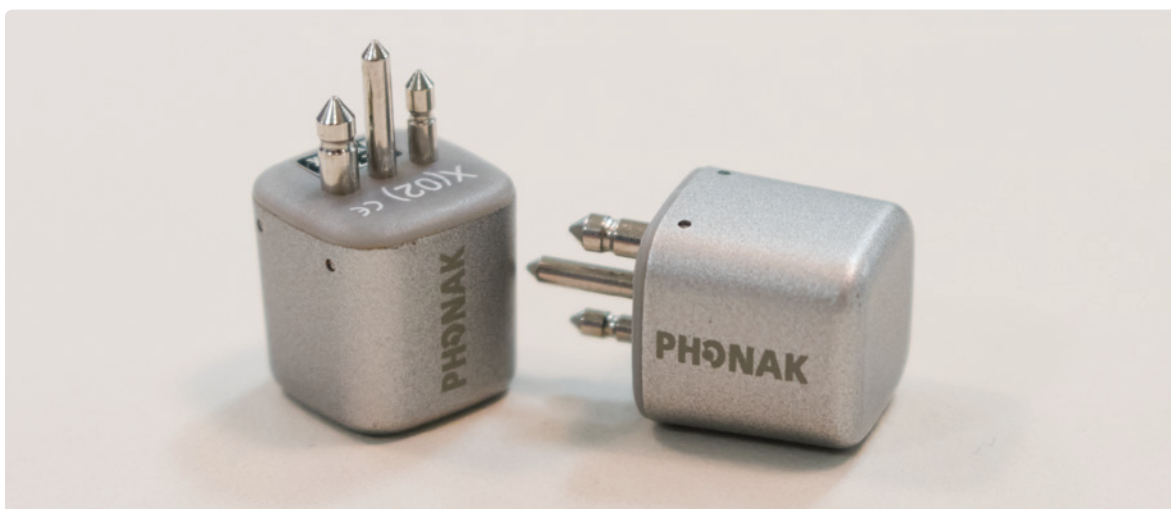
A Phonak Roger X receiver